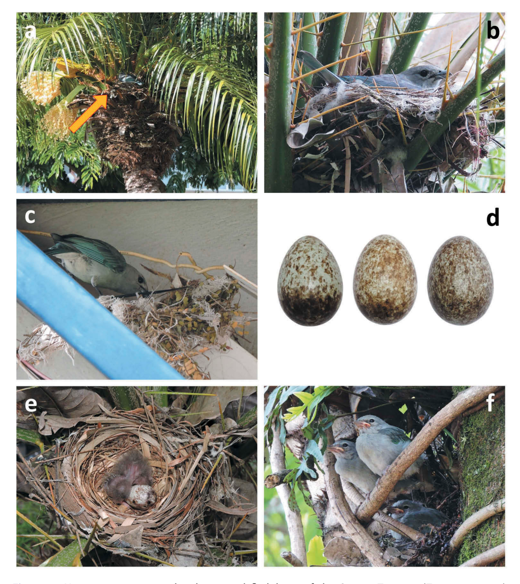
Figure 2. Nest site, nest, eggs, hatchings and fledglings of the Sayaca Tanager ( Tangara sayaca ). A nesting site under the leaves of a Phoenix palm (a), an incubating female (b), a nest externally coated with compound leaves and sewing threads in a human building structure (c), patterns of egg shell colouration (d), 1-day-old hatchling and one egg (e), and newly 17-day-old fledglings (f).

colouration was quite similar to that of adults, but without the same brightly bluish tonality in the primary wing feathers (Figure 2(f)).